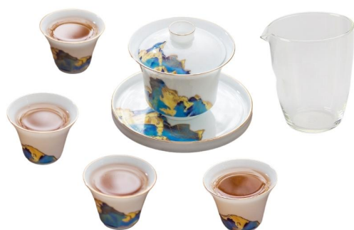
Covered Tea Bowl